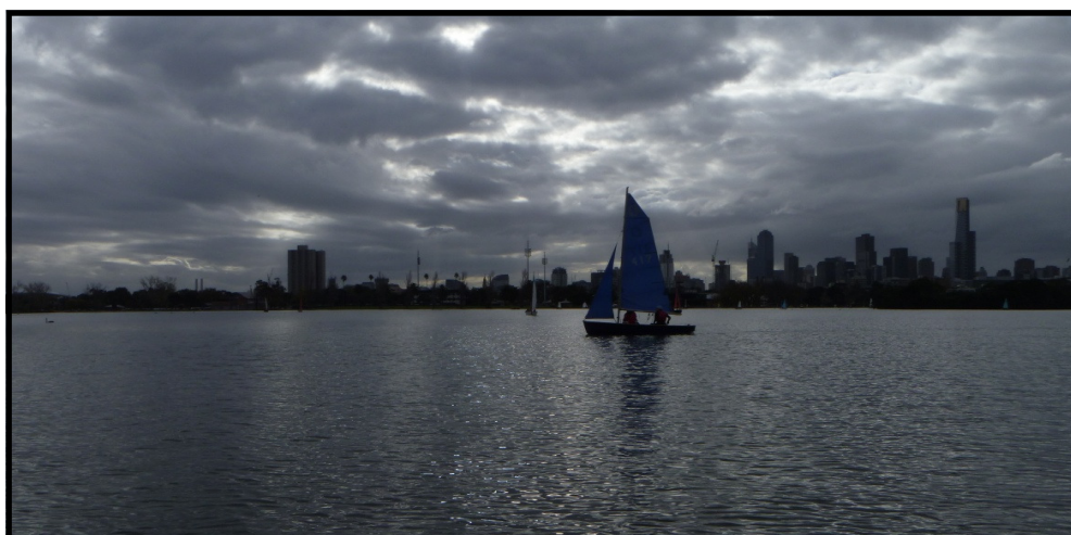
A peaceful day on Albert Park Lake. Saturday 19th May

Newsletter of the Albert Park Yacht Club