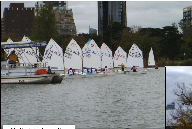
Optimists from the bay migrate to the lake for the Winter