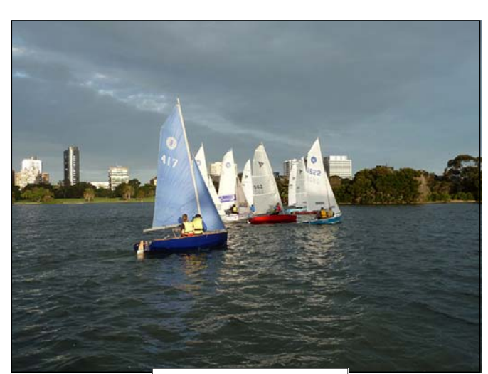
Sailing as the sun goes down in the Twilight Series

"Nope" said his wife, "they are male. To get their attention you have to turn them on and as soon as you commit to one, you realize that you could have got a better model if you had only waited a little longer"